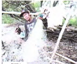
MEXICO LOS PINOS FOREST AREA

It is an important project because it will help to protect the forest and the birds that live there. The idea is to create a nature reserve that will protect the forest and the birds that live there.