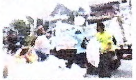
A LARGE PILE OF PLASTIC WASTE, ILLUSTRATING THE PROBLEM OF PLASTIC POLLUTION.