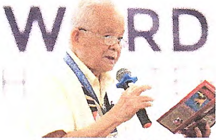
Write about climate change