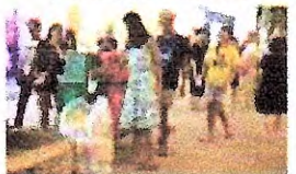
A GROUP OF PEOPLE STANDING TOGETHER, POSSIBLY AT A COMMUNITY MEETING OR EVENT.

Sustaining the positive effects of the closing of Boracay entails a joint effort with the residents and environmentalists. This can be done by enforcing the use of rules, by being a responsible tourist and by helping spread the positive effects of sustainable tourism.