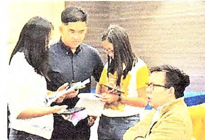
Learn what PH is doing vs. climate change